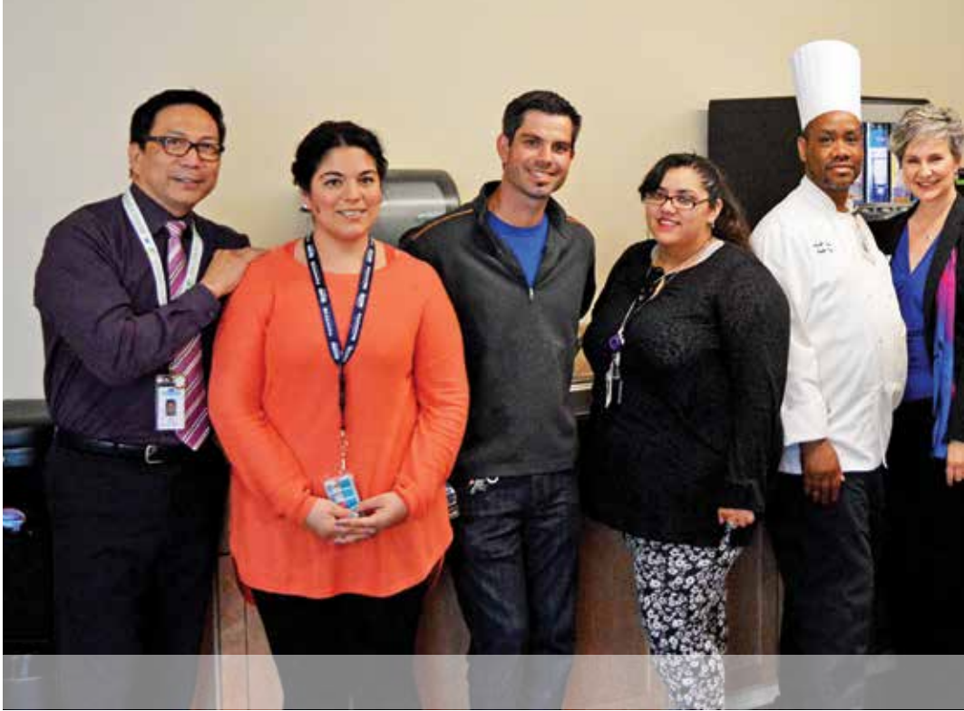
Clockwise: Staff at International Bite; Employee Lounge Remodel team; Picnic in the Meadow fidget quilt with cookies and a sandwich