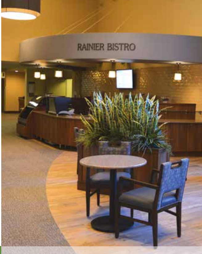
Cottage construction in progress; Rainier Bistro in The Terrace