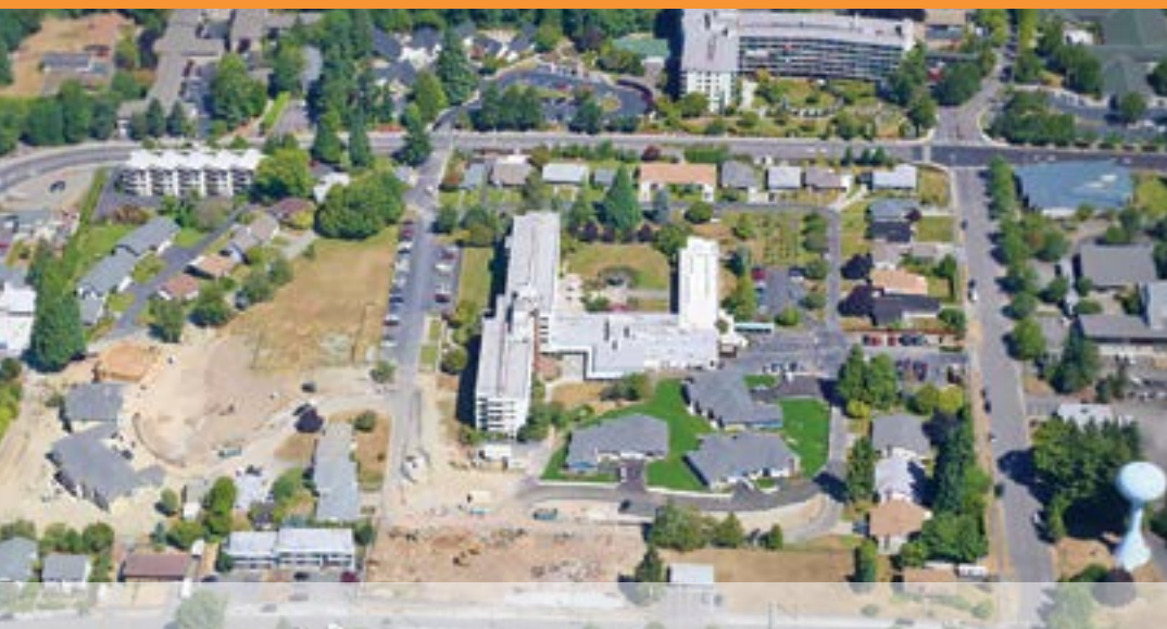
Aerial view of Wesley Homes Des Moines construction, July 2017