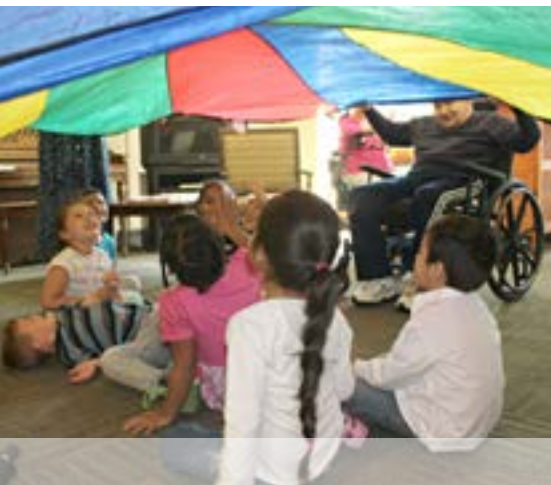
Preschool kids enjoy time with care center residents.

Visitors to the Des Moines Open House on Sunday, October 1st will learn more about these programs and be treated to a first look at updated architectural drawings for the new Gardens building. Information about Bradley Park in Puyallup and Wesley’s next new community in Renton will also be available.