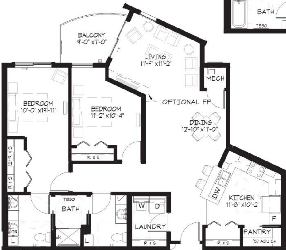
Camano Two Bedroom Approx. 1,265 s.f.