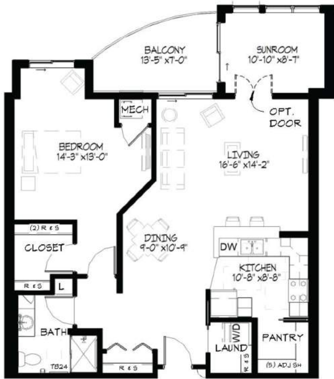
Redondo One Bedroom Plus Den Approx. 1,115 s.f.