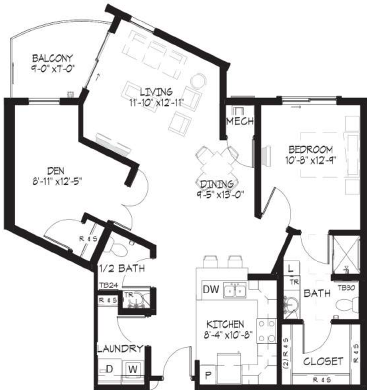
Tahoma One Bedroom Plus Den Approx. 1,075 s.f.