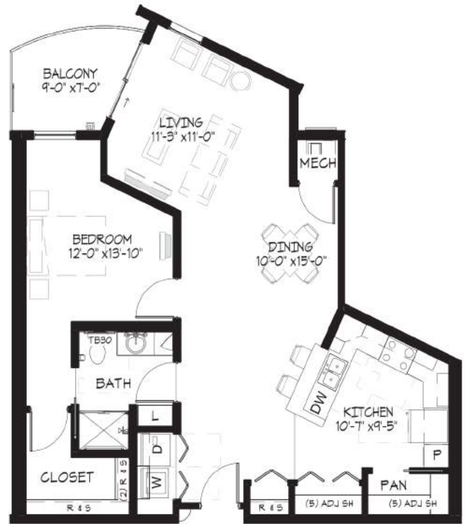
Rose One Bedroom Approx. 975 s.f.