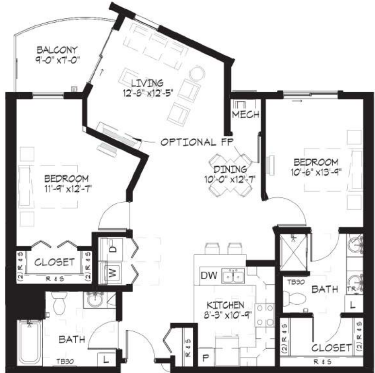
Bainbridge Two Bedroom Approx. 1,200 s.f.