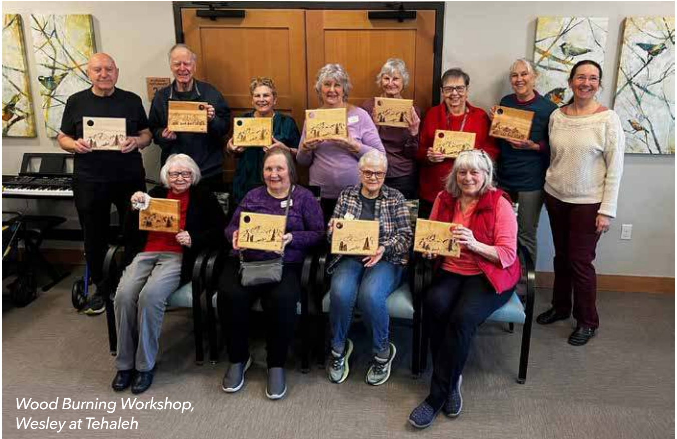
Wood Burning Workshop, Wesley at Tehaleh

Please register in advance for each class so we can send you the appropriate link and details.